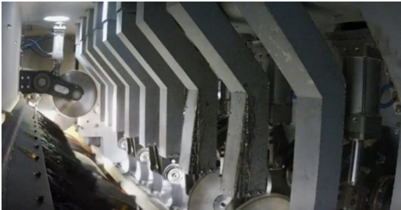
INSIDE THE OPTI-TRIM

ACHIEVE YOUR QUALITY, PROFITABILITY & PRODUCTIVITÉ OBJECTIVES WITH THE OPTI-TRIM