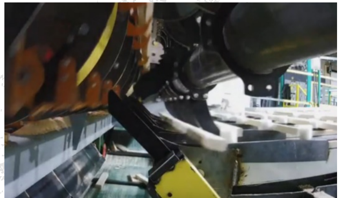
INSIDE THE OPTI-TRIM